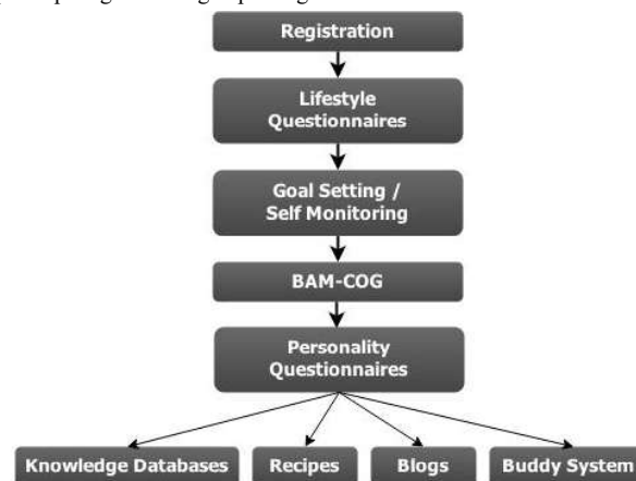
Figure 1. Flowchart of process a new participant goes through upon registration.

Considering the field setting for this intervention, it is difficult to control for concomitant care, or better yet if the BAM inspires participants to make use of other platforms to alter their health behavior in a positive way, this accomplishes the BAM’s goals. The BAM can and may function as a gateway to healthy behavior. Using the GSM and the yearly follow-up, the BAM can track changes over time even if participants actively use outside help that the BAM refers them to.